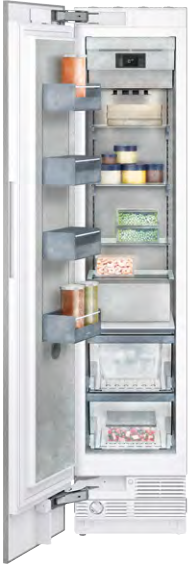
Type reference RF 411