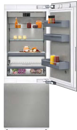
Type reference RB 472

Niche width 91.4 cm Niche height 213.4 cm Handleless option Cushioned door closing system Fresh cooling close to 0 °C Integrated ice maker in freezer compartment Warm white, glare-free LEDs Net volume 555 l