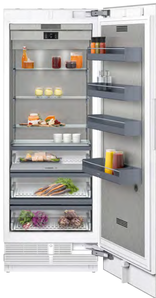
Type reference RC 472

Niche width 91.4 cm Niche height 213.4 cm Handleless option Cushioned door closing system Fresh cooling 0 °C Warm white, glare-free LEDs Net volume 579 l