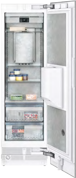
Type reference RF 463