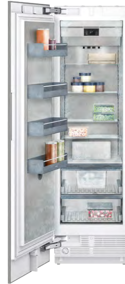
Type reference RF 461

Niche width 76.2 cm Niche height 213.4 cm Handleless option Cushioned door closing system Integrated ice maker Warm white, glare-free LEDs Net volume 445 l