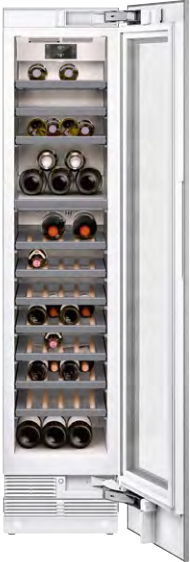
Type reference RW 414