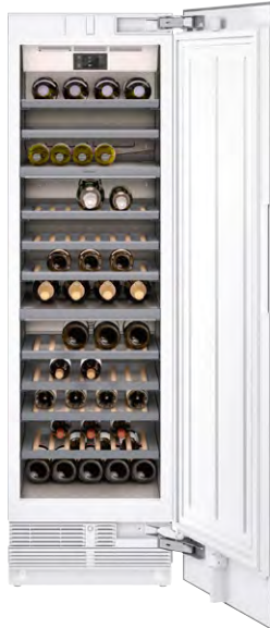
Type reference RW 466

Niche width 61 cm Niche height 213.4 cm Three climate zones Glass door, handleless option Cushioned door closing system Five preset lighting scenarios Warm white, glare-free LEDs Capacity 99 bottles