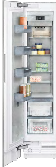
Type reference RF 410

Niche width 45.7 cm Niche height 213.4 cm Handleless option Cushioned door closing system Integrated ice maker Warm white, glare-free LEDs Net volume 240 l