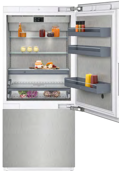
Type reference RB 492

Niche width 91.4 cm Niche height 213.4 cm Handleless option Cushioned door closing system Fresh cooling close to 0 °C Integrated ice maker in freezer compartment Warm white, glare-free LEDs Net volume 552 l