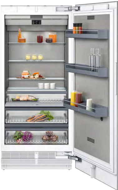
Type reference RC 492