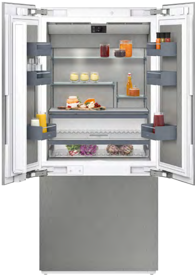
Type reference RY 492