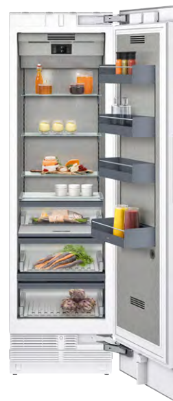
Type reference RC 462

Niche width 76.2 cm Niche height 213.4 cm Handleless option Cushioned door closing system Fresh cooling 0 °C Warm white, glare-free LEDs Net volume 467 l