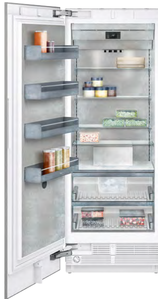
Type reference RF 471

Niche width 61 cm Niche height 213.4 cm Handleless option Cushioned door closing system Illuminated ice and water dispenser with proximity sensor Warm white, glare-free LEDs Net volume 304 l