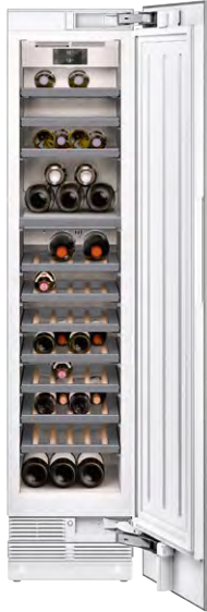
Type reference RW 414

Niche width 45.7 cm Niche height 213.4 cm Two climate zones Glass door, handleless option Cushioned door closing system Five preset lighting scenarios Warm white, glare-free LEDs Capacity 70 bottles