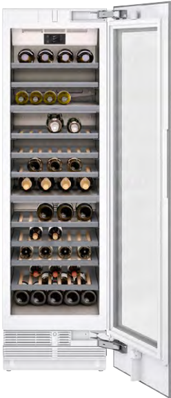
Type reference RW 466