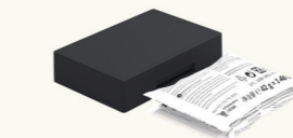
Ethylene absorber ACLETHST10