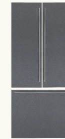
Door panels RVA 421 922

Dark brushed stainless steel, handleless