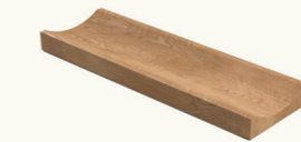
Bottle support RVA 438 040