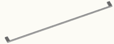
Handle bar RA 425 910

Dark brushed stainless steel, with handles