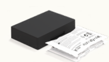
Ethylene absorber ACLETHST10