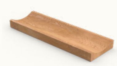
Bottle support RVA 438 040