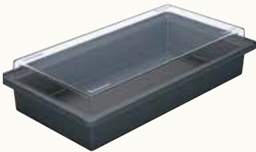
Storage container RA 430 100