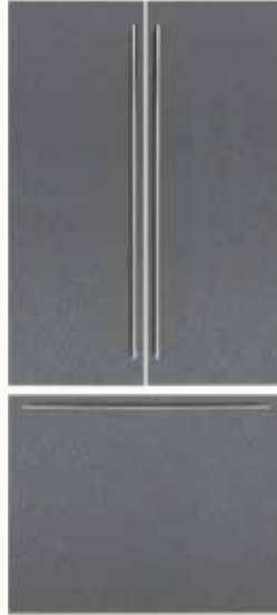
Door panels RVA 421 922

Dark brushed stainless steel, handleless