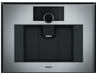
Fully automatic espresso machine GC461

Width 60.0 cm Height 14.0 cm With design front / fully integrated 3 vacuum levels