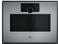
Combi-steam oven GS47..

Width 76.0 cm Height 45.0 cm Fixed water connection 14 heating methods Automatic cleaning