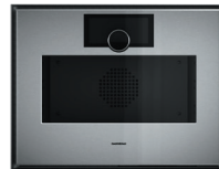
Combi-steam oven GS45..

Width 60.0 cm Height 45.0 cm Fixed water connection 14 heating methods Automatic cleaning