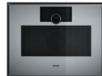
Combi-microwave oven GM45..

Width 76.0 cm Height 45.0 cm Single operation and combination of microwave and oven 9 heating methods Favourites