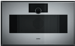
Combi-steam oven GS48..

Width 60.0 cm Height 60.0 cm 15 heating methods Pyrolysis