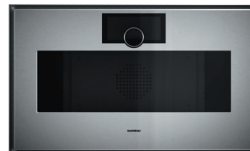
Combi-microwave oven GM48..

Width 60.0 cm Height 45.0 cm Manual tank filling Classic and Barista mode Full automatic cleaning and descaling with cartridges