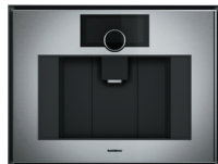
Fully automatic espresso machine GC451

Width 60.0 cm Height 45.0 cm Fresh water connection Classic and Barista mode Full automatic cleaning and descaling with cartridges